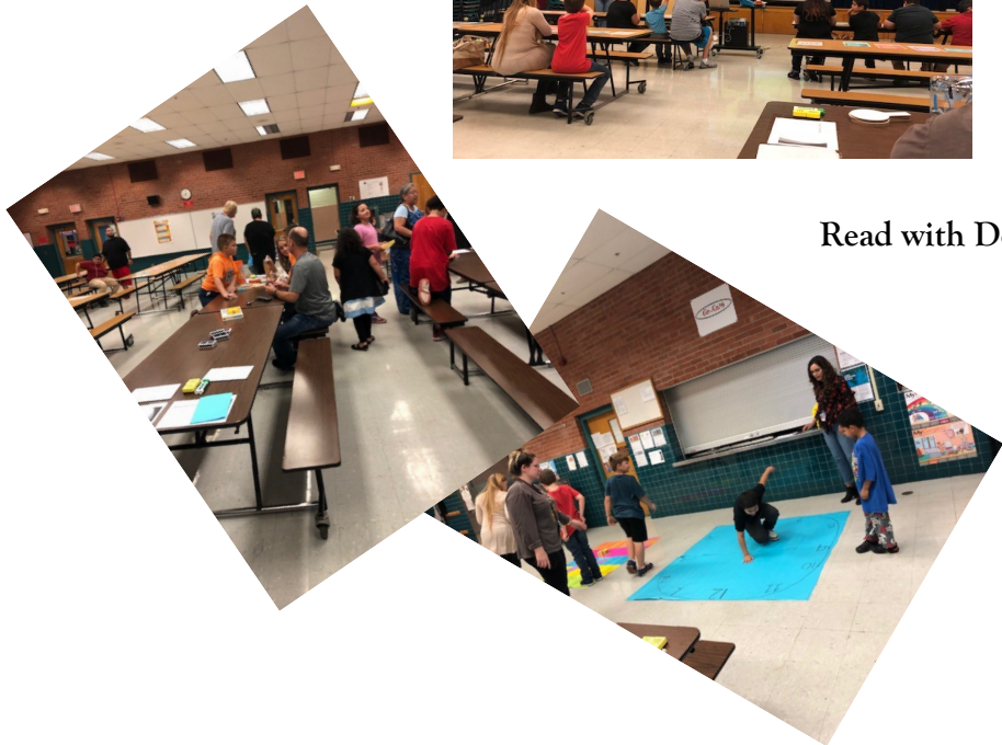
Read with Dogs